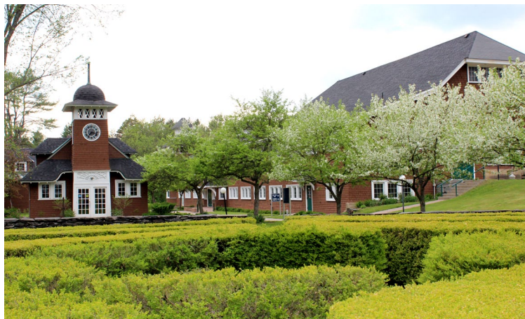
Greatwood Gardens at Goddard College, Plainfield, VT

During the past few decades, the concept of historic preservation has grown beyond protecting a single building or urban district to include the historic landscape that provides the setting and context for a property as well as much larger landscapes that have regional and national significance. In response to this growing interest in the historic preservation and documentation of landscapes, the American Society of Landscape Architects worked with the National Park Service to create a national program. In 2000, the National Park Service established the Historic American Landscapes Survey (HALS) to document historic landscapes in the United States. The Vermont Chapter of the American Society of Landscape Architects (VTASLA), the Vermont Department of Housing and Community Development and Division for Historic Preservation documented three historic Vermont landscapes this summer for the HALS. For the first time in Vermont, we documented the following three historic landscapes. A huge thanks goes out to Richard Amore, Gail Henderson-King and Devon Colman for their significant time spent on the submissions.