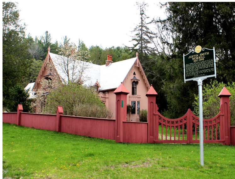
Justin Morrill Estate and Gardens, Strafford, VT

He was the chief landscape architect for the restoration at Colonial Williamsburg, Virginia from its inception in 1928 until 1941. The Goddard College Greatwood Estate Campus, including the gardens, was listed on the National Register of Historic Places in 1996. Goddard College is aware of the historic significance of the Greatwood Campus and is conducting on-going repairs to structures as funding allows.