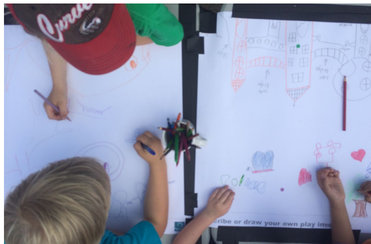
Students participating in a drawing activity during IAA Field Day

If anyone would like to be involved in the IAA Charette process, please contact: Hannah Loope for more information.