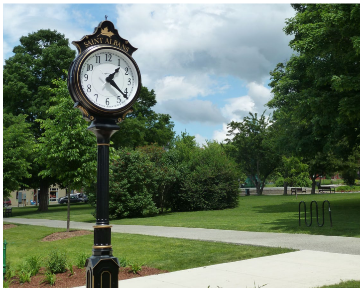
Taylor Park, St. Albans, VT

City in 1870. Today, it is the focal point of St. Albans and is listed as a contributing resource to the St. Albans Historic District listed in the National Register of Historic Places. The buildings on Main and Church Streets that border Taylor Park create a courtyard, reinforcing the aesthetic value of this open space in a downtown environment. Taylor Park is the central public gathering place for St. Albans and serves as the physical, historic and cultural center of the city. It provides today's residents and visitors with a valuable place to gather, recreate, celebrate and engage in community life.